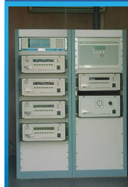
Your Monitoring Network

Web portal can be used to provide links to regulations, SOPs, manufacturer's manuals, as well as field forms and worksheets.