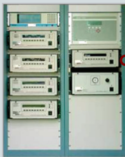
Equipment At Site A