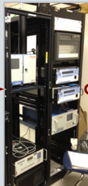
Equipment At Site B