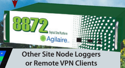
Other Site Node Loggers or Remote VPN Clients