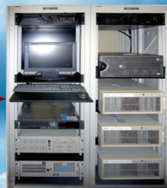
AirVision Central Server